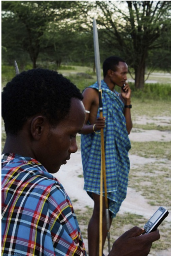
Figure 1. Cell Phones Are Now Widely Used in Rural Areas of Africa. In this case, Barabaig tribesmen discuss the state of their herds.

The challenge is making technology accessible. In the hands of all stakeholders, even basic smartphones provide a wide range of conservation-relevant data. Rural communities can record incidents of human–wildlife conflict, monitor habitat, or anonymously report intelligence information to authorities. Broader participation would increase the volume of data collected and afford opportunities to engage local communities, thus resulting in long-term conservation success [84].